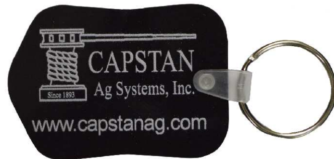
Item 2: 118640-036