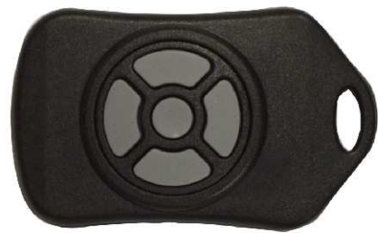
Item 1: 118640-028