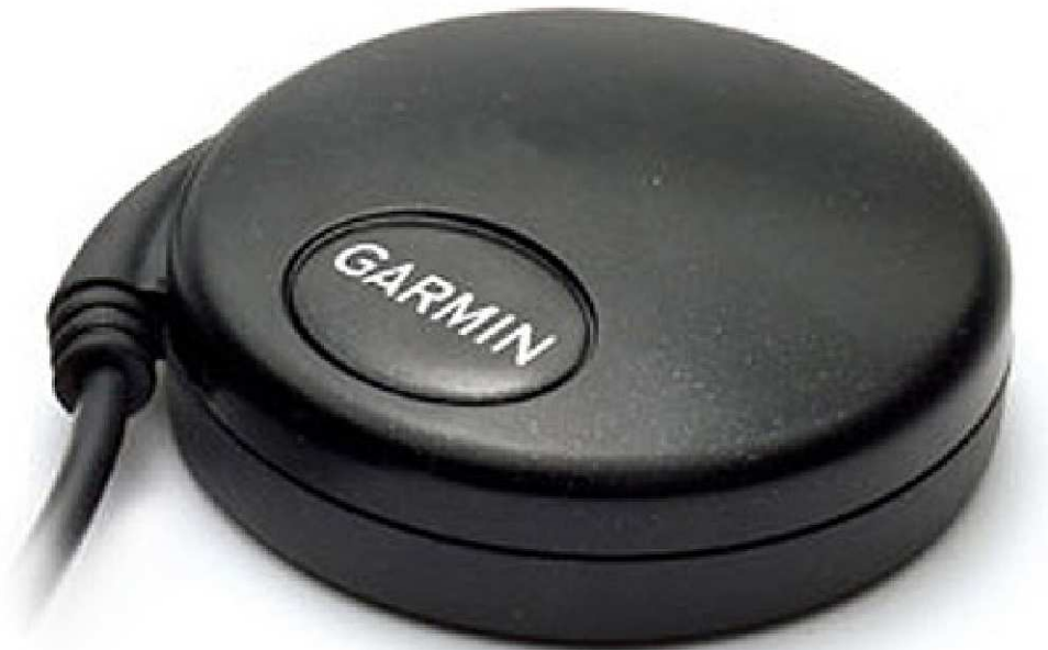
Garmin: GPS18X LVC